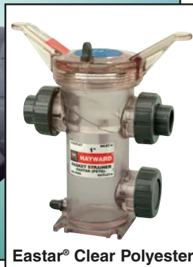
Eastar® Clear Polyester