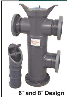
6" and 8" Design